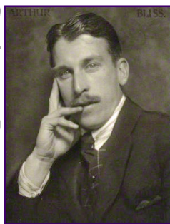
SIR ARTHUR BLISS